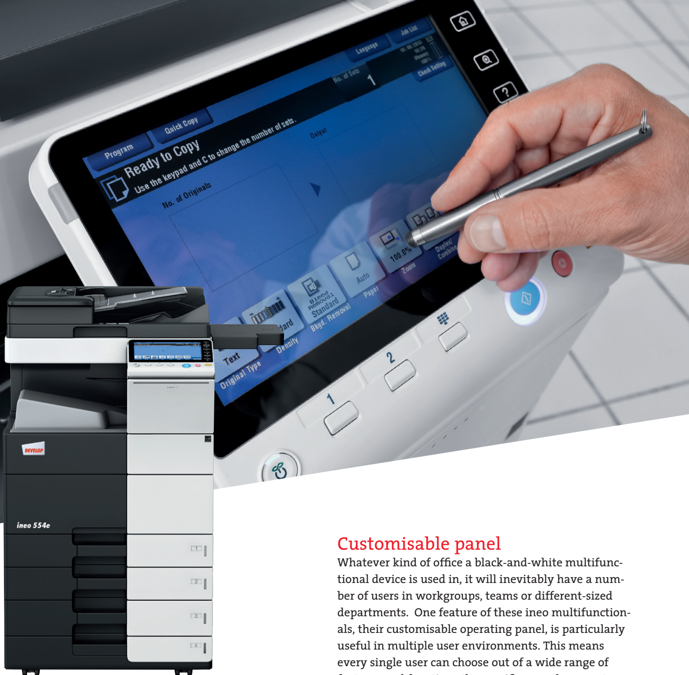
ineo 554e with paper feeder (PC-210), working table (WT-506) and output tray (OT-506)