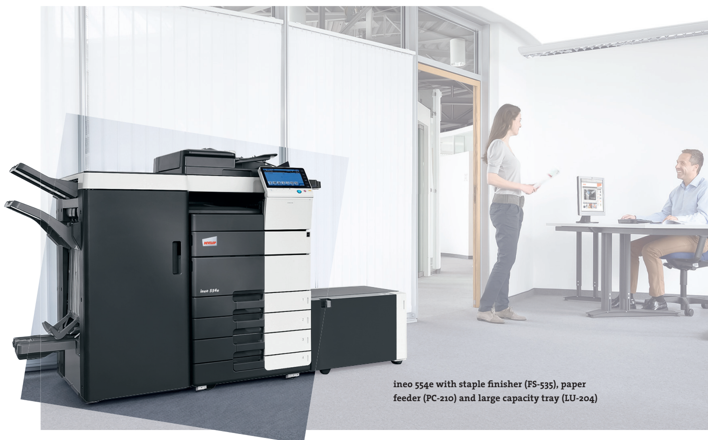
ineo 554e with staple finisher (FS-535), paper feeder (PC-210) and large capacity tray (LU-204)

These black-and-white systems come with a number of energy-saving features that cut power consumption by over 40% compared to predecessor models. While this kind of economy saves money, other green features are ecologically beneficial. And that means DEVELOP's ineo e line-up is not only good for the environment but also boosts the owner's green credentials.