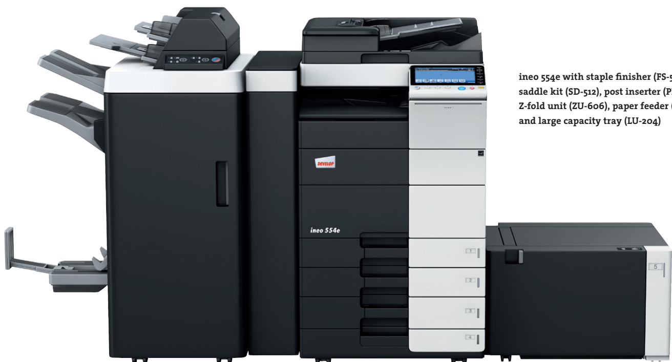
ineo 554e with staple finisher (FS-535), saddle kit (SD-512), post inserter (PI-505), Z-fold unit (ZU-606), paper feeder (PC-210) and large capacity tray (LU-204)

Each of these multifunctional office devices – the ineo 224e, ineo 284e, the ineo 364e, the ineo 454e and the ineo 554e – is not only remarkably easy to use but also offers a wide variety of features to facilitate everyday office tasks. By saving office users time in printing, copying or scanning, they can return to their normal work faster. And that will ultimately help boost productivity.